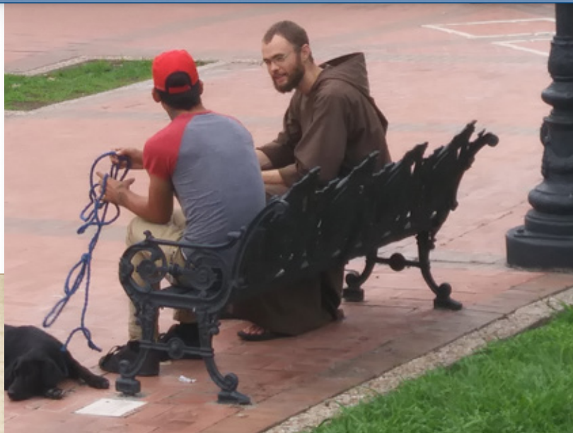
Friars listened attentively to their guests' stories, and talked and prayed with them.

After the food is prepared and the kitchen cleaned, we congregate at Milam Park, located in downtown San Antonio. There we set up tables, chairs, and musical instruments to continue with the mission of living the Gospel. While at the park, we feed the hungry spiritually and physically. The Friars encounter different people from many backgrounds, and in this encounter we listen attentively to their stories, talk to them, and pray with them. Meanwhile, other Friars meet and greet the people who approach the breakfast area.