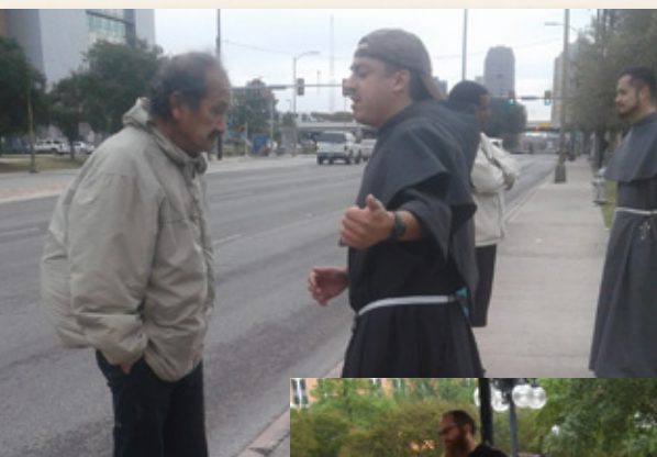
The Friars greeted the people who approached the breakfast area.

We start early in the morning with Mass and morning prayer, and afterwards go to a local center called Inner City Development (ICD) to prepare breakfast for the homeless and hungry. ICD, a nonprofit, community-based organization, contributes to the effort by providing the use of their facility, in this case a proper kitchen to make breakfast.