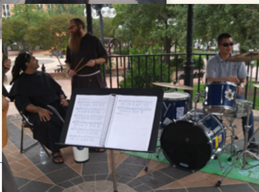
Friars provided musical entertainment.