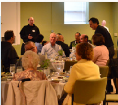
The Friars enjoyed the opportunity to visit with the San Damiano Legacy Society members and other guests.