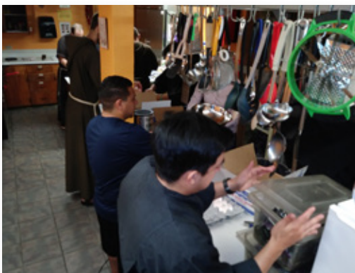
The Friars not only handed out breakfast; they also prepared it.

As instruments of God’s peace that’s our mission, putting into practice St. Francis’ peace prayer: “Lord, make me an instrument of your peace. Where there is hatred, let me sow love; where there is injury, pardon; where there is doubt, faith; where there is despair, hope; where there is darkness, light; and where there is sadness, joy. O Divine Master, grant that I may not so much seek to be consoled as to console, to be understood as to understand, to be loved as to love. For it is in giving that we receive, it is in pardoning that we are pardoned, and it is in dying that we are born to eternal life.”