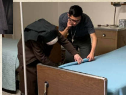
Lifelong learning includes practical lessons such as how to form the perfect 'hospital corner' when making up a bed.

Miracles happen! And so I dare to say, in the spirit of Msgr. Kelly, if the Cubs can win a World Series, Catholics can learn how to teach Catholicism!