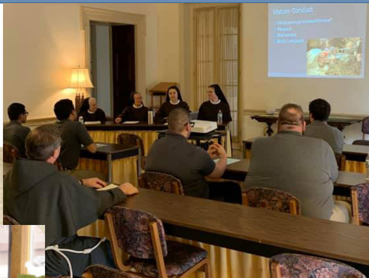
Conventual Franciscan Postulants attend a lecture by the Sisters while visiting a convent near their residence.