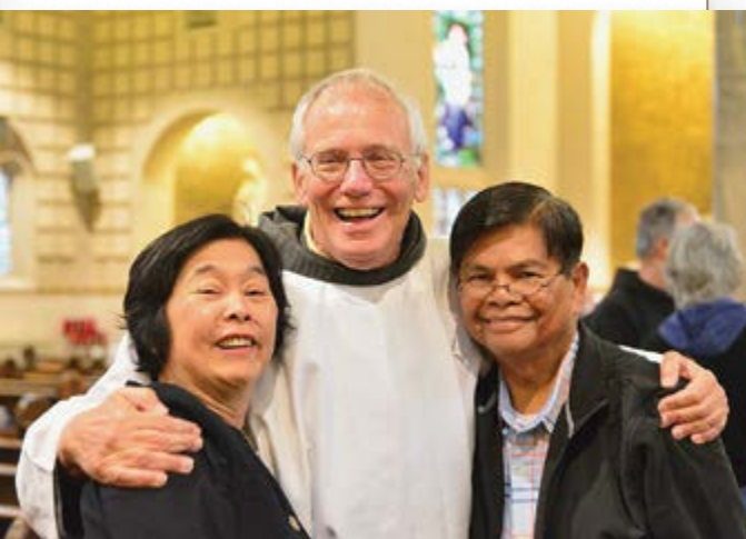
Thank you to all who support our ministries and services to God's people.

This gift counts against your required minimum distribution amount and is not subject to federal tax.