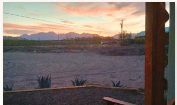
The view from the front porch of the Hermitage

“Desert and mountains are special places of encounter with the Lord,” he said. “Holy Cross Retreats brings you to the doorstep of both in their marvelous Hermitage.”