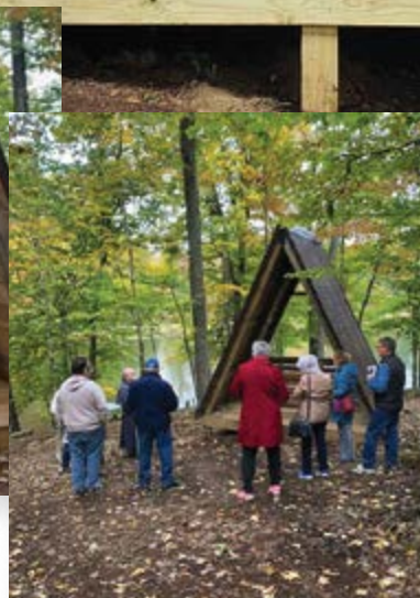
Top: Some of the helping hands enjoy the fruits of their labor.